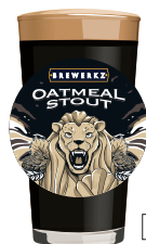
OATMEAL STOUT 5.5% ABV, 24 IBU Coffee, caramel, roasty