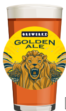
GOLDEN ALE 4.7% ABV, 22 IBU Malty, bitterness