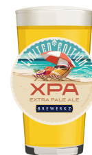
XPA EXTRA PALE ALE 4.5% ABV, 18 IBU Pineapple, peach, white grape