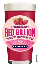
PROBIOTIC RASPBERRY SOUR 4.5% ABV, 0 IBU Fruity, tart raspberry