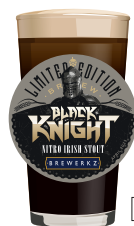
BLACK KNIGHT NITRO IRISH STOUT 4.1% ABV, 30 IBU Coffee, chocolate, cocoa

Brewed with NEWater in collaboration with PUB