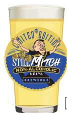
STILL MITCH NON-ALCOHOLIC <0.5% ABV, 41 IBU Mango, passionfruit