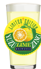
YUZU LIME ZING 0% ABV Yuzu, key lime