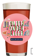
ONDEH ONDEH AMBER LAGER 4.5% ABV, 7 IBU Pandan, coconut