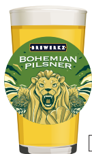
BOHEMIAN PILSNER 5.0% ABV, 27 IBU Crisp, malty, bitterness