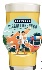
CIRCUIT BREAKER NEW ENGLAND IPA 5.9% ABV, 14 IBU Mango, cempedak, pineapple