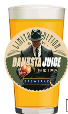
DANKSTA JUICE NEW ENGLAND IPA 6.5% ABV, 20 IBU Peach Haze with dank vibes