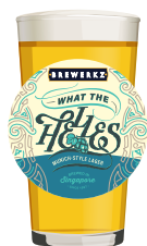
WHAT THE HELLES MUNICH-STYLE LAGER 4.5% ABV, 9 IBU Grainy sweet, floral overtones