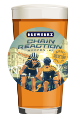
CHAIN REACTION MODERN IPA 5.0% ABV, 48 IBU Mango, pineapple