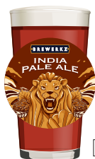
INDIA PALE ALE 5.4% ABV, 51 IBU Floral, malty