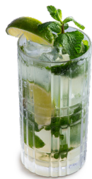
MOJITO 23 Rum, freshly squeezed lime, mint leaves, sugar and a splash of soda