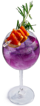
MYSTIC PEA 23 Brass Lion Gin, butterfly pea, tonic