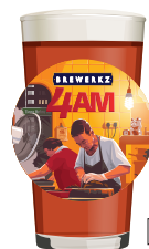
4AM DOUBLE IPA 7.5% ABV, 80 IBU Resin, pineapple, mango