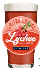
LYCHEE AMBER 5.0% ABV, 15 IBU Lychee, caramel