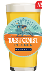
WEST COAST PILSNER 5.3% ABV, 40 IBU Citrus, pine, kaffir lime