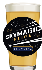
SKYMAGIC NEIPA LOW-ABV 2.4 ABV, 22 IBU Mango, passionfruit, red berries