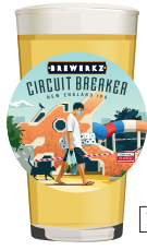
CIRCUIT BREAKER NEW ENGLAND IPA 5.9% ABV, 14 IBU Mango, cempedak, pineapple