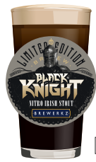
BLACK KNIGHT NITRO IRISH STOUT 4.1% ABV, 30 IBU Coffee, chocolate, cocoa

Brewed with NEWater in collaboration with PUB