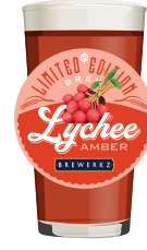
LYCHEE AMBER 5.0% ABV, 15 IBU Lychee, caramel