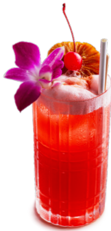
SINGAPORE SLING 19 Gin, cherry brandy, dom, Cointreau, Angostura, pineapple juice, lime juice, grenadine