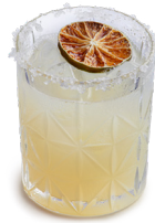
MARGARITA 18 Tequila and lime mix