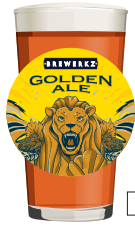
GOLDEN ALE 4.7% ABV, 22 IBU Malty, bitterness