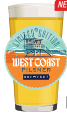
WEST COAST PILSNER 5.3% ABV, 40 IBU Citrus, pine, kaffir lime