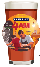
4AM DOUBLE IPA 7.5% ABV, 80 IBU Resin, pineapple, mango