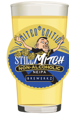
STILL MITCH NEIPA NON-ALCOHOLIC <0.5% ABV, 41 IBU Mango, passionfruit