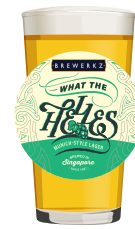
WHAT THE HELLES MUNICH-STYLE LAGER 4.5% ABV, 9 IBU Grainy sweet, floral overtones