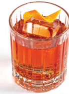
OLD FASHIONED 18 Whiskey, simple syrup, Angostura Bitter, orange peel garnish