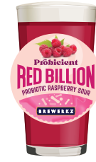
PROBIOTIC RASPBERRY SOUR 4.5% ABV, 0 IBU Fruity, tart raspberry