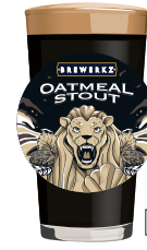
OATMEAL STOUT 5.5% ABV, 24 IBU Coffee, caramel, roasty