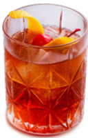
NEGRONI 18 Gin, Campari, Vermouth