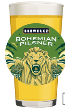
BOHEMIAN PILSNER 5.0% ABV, 27 IBU Crisp, malty, bitterness