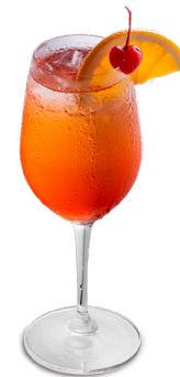
APEROL SPRITZ 17 Aperol, prosecco and soda water