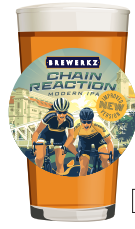
CHAIN REACTION MODERN IPA 5.0% ABV, 48 IBU Mango, pineapple