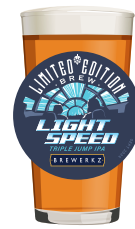
LIGHTSPEED TRIPLE JUMP IPA 10.0% ABV, 27 IBU Coconut, mango, apricot