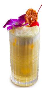
PIÑA COLADA 18 Rum, pineapple juice, pineapple slices and cream