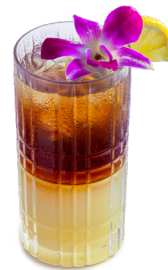
LONG ISLAND TEA 19 Vodka, gin, rum, tequila, triple sec, lemon juice, splash of Coke