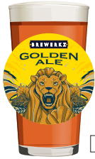
GOLDEN ALE 4.7% ABV, 22 IBU Malty, bitterness