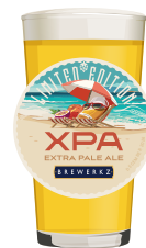
XPA EXTRA PALE ALE 4.5% ABV, 18 IBU Pineapple, peach, white grape