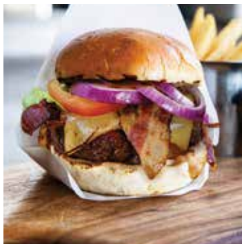
AMERICAN COWBOY* 28 Topped with crispy bacon, Cheddar cheese and homemade BBQ sauce