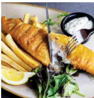
GOLDEN ALE FISH & CHIPS 28 Golden Ale, beer-battered seasonal fish served with french fries and white tartar sauce