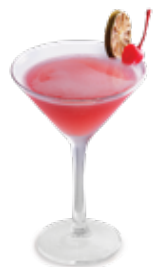
COSMOPOLITAN 22 Vodka, triple sec, cranberry juice and lime juice