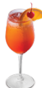
APEROL SPRITZ 22 Aperol, prosecco and soda water