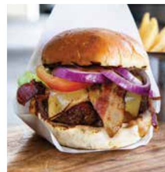
AMERICAN COWBOY 28 Topped with crispy bacon, Cheddar cheese and homemade BBQ sauce