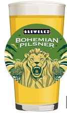
BOHEMIAN PILSNER 5.0% ABV, 27 IBU Crisp, malty, bitterness