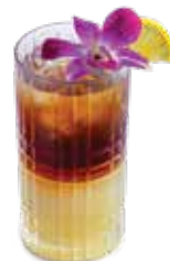
LONG ISLAND TEA 25 Gin, vodka, rum, tequila, triple sec, lime mix, splash of Coke