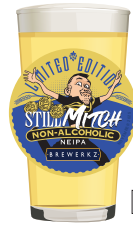
STILL MITCH NON-ALCOHOLIC NEIPA <0.5% ABV, 41 IBU Mango, passionfruit