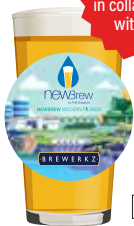
NEWBREW MODERN PILSNER 5% ABV, 15 IBU Rock melon, pineapple, white grapes