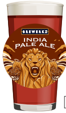
INDIA PALE ALE 5.4% ABV, 51 IBU Floral, malty