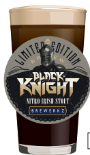
BLACK KNIGHT NITRO IRISH STOUT 4.1% ABV, 30 IBU Coffee, chocolate, cocoa

Brewed with NEWater in collaboration with PUB