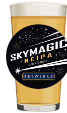
SKYMAGIC NEIPA LOW-ABV 2.4 ABV, 22 IBU Mango, passionfruit, red berries