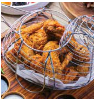
GOLDEN BUTTERMILK CHICKEN-IN-BASKET 54 Buttermilk marination, assorted dips