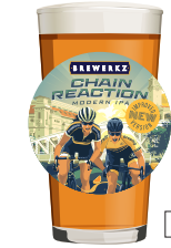
CHAIN REACTION MODERN IPA 5.0% ABV, 48 IBU Mango, pineapple