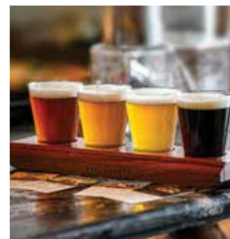
BEER SAMPLERS 4X130ML 28 Hop on a flavour flight with our Beer Sampler Set. Our top picks: Golden Ale, Bohemian Pilsner, Circuit Breaker New England IPA, 4AM Double IPA. *Not applicable to any other promotions or privileges