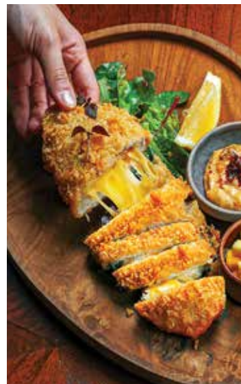
NEW 'MILLE-FEUILLE' PORK CHEESE KATSU 30 Please allow 20 minutes for preparation 'Pork lapis', gingerflower calamansi salad, mango salsa