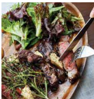
WAGYU BEEF RIBEYE (300g) GF 72 Australian wagyu (MBS 4-5), balsamic mixed greens, confit potatoes, and traditional beef jus