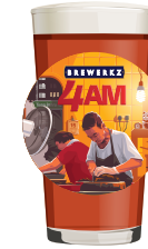
4AM DOUBLE IPA 7.5% ABV, 80 IBU Resin, pineapple, mango