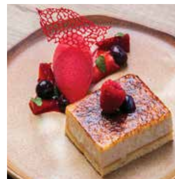
NEW BRÛLÉE CHEESECAKE VEG 14 Raspberry sorbet, mixed berries coulis, three cheese