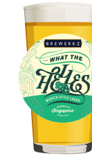
WHAT THE HELLES MUNICH-STYLE LAGER 4.5% ABV, 9 IBU Grainy sweet, floral overtones