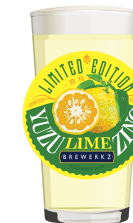
YUZU LIME ZING 0% ABV Yuzu, key lime