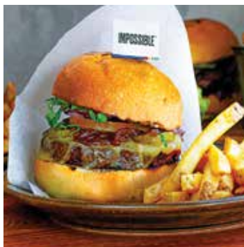
IMPOSSIBLE™* VEG 27 Made from 100% plant-based meat patty, topped with mustard sauce, Cheddar cheese, dill pickles, onion relish, tomatoes and lettuce

*Request to change your sides from fries to roasted vegetables? Just inform our server.