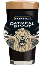
OATMEAL STOUT 5.5% ABV, 24 IBU Coffee, caramel, roasty