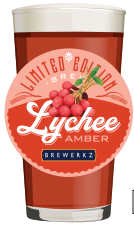
LYCHEE AMBER 5.0% ABV, 15 IBU Lychee, caramel