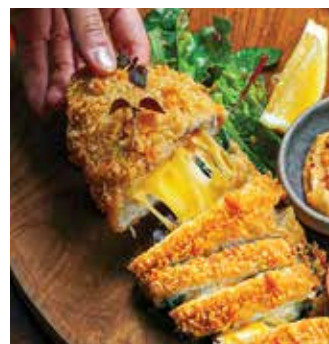
'MILLE-FEUILLE' PORK CHEESE KATSU 30 Please allow 20 minutes for preparation 'Pork lapis', gingerflower calamansi salad, mango salsa