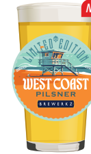
WEST COAST PILSNER 5.3% ABV, 40 IBU Citrus, pine, kaffir lime