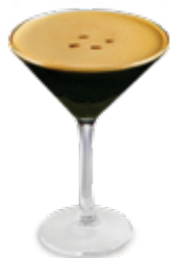
ESPRESSO MARTINI 22 Vodka, Espresso, Kahlúa, simple syrup