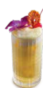
SHAKEN PIÑA COLADA 22 Malibu, pineapple juice, pineapple slice and cream