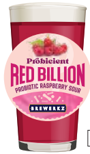
PROBIOTIC RASPBERRY SOUR 4.5% ABV, 0 IBU Fruity, tart raspberry