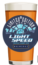
LIGHTSPEED TRIPLE JUMP IPA 10.0% ABV, 27 IBU Coconut, mango, apricot