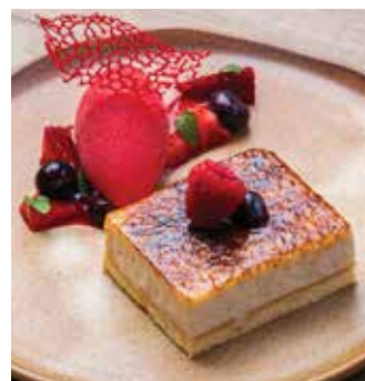
BRÛLÉE CHEESECAKE VEG 14 Raspberry sorbet, mixed berries coulis, three cheese