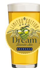
DREAM BLONDE ALE 4.5% ABV, 18 IBU Passionfruit, mango, lemon