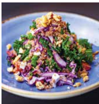
SUPERFOODS SALAD VEG VG GF 16 Kale, red cabbage, quinoa, cashew nut, beetroot, feta cheese, pumpkin seeds, honey mustard vinaigrette + Lemongrass chicken 6 + Grilled trout 10