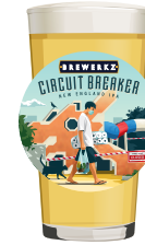
CIRCUIT BREAKER NEW ENGLAND IPA 5.9% ABV, 14 IBU Mango, cempedak, pineapple