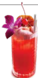
SINGAPORE SLING 25 Gin, cherry brandy, dom, cointreau, angostura, pineapple juice, lime juice, grenadine