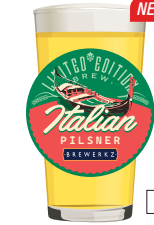
ITALIAN PILSNER 4.9% ABV, 27 IBU Floral hops, light spice, malt snap