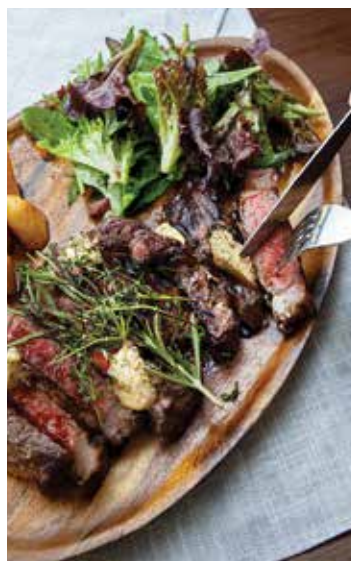
WAGYU BEEF RIBEYE (300g) GF 72 Australian wagyu (MBS 4-5), balsamic mixed greens, confit potatoes, and traditional beef jus