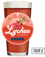
LYCHEE AMBER 5.0% ABV, 15 IBU Lychee, caramel