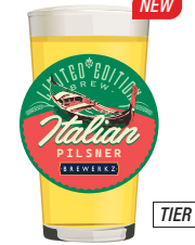
ITALIAN PILSNER 4.9% ABV, 27 IBU Floral hops, light spice, malt snap