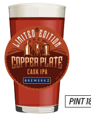
COPPER PLATE CASK IPA 5.0% ABV, 50 IBU Biscuity, orange