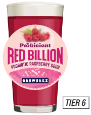
PROBIOTIC RED BILLION PROBIOTIC RASPBERRY SOUR 4.5% ABV, 0 IBU Fruity, tart raspberry