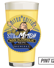
STILL MITCH NEIPA NON-ALCOHOLIC <0.5% ABV, 41 IBU Mango, passionfruit