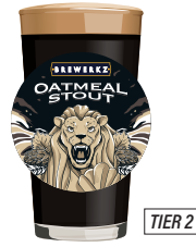
OATMEAL STOUT 5.5% ABV, 24 IBU Coffee, caramel, roasty