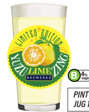
YUZU LIME ZING 0% ABV Yuzu, key lime