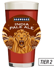
INDIA PALE ALE 5.4% ABV, 51 IBU Floral, malty