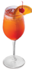
APEROL SPRITZ 21 Aperol, prosecco and soda water