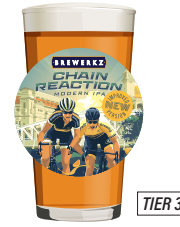
CHAIN REACTION MODERN IPA 5.0% ABV, 48 IBU Mango, pineapple