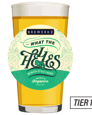
WHAT THE HELLES MUNICH-STYLE LAGER 4.5% ABV, 9 IBU Grainy sweet, floral