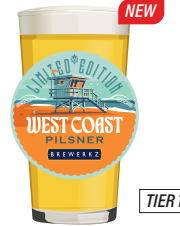
WEST COAST PILSNER 5.3% ABV, 40 IBU Citrus, pine, kaffir lime