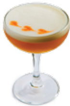
CUBAN SOUR 23 Don Papa rum, Bols apricot brandy, lemon & lime juice, egg white