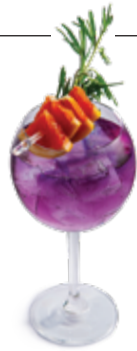
MYSTIC PEA 23 Brass Lion Butterfly Pea Gin, tonic, grapefruit, rosemary