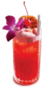
SINGAPORE SLING 25 Gin, cherry brandy, dom, orange liqueur, bitters, grenadine, pineapple, lime juice