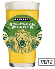
BOHEMIAN PILSNER 5.0% ABV, 27 IBU Crisp, malty, bitterness