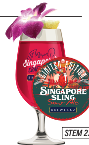
SINGAPORE SLING SOUR ALE 5% ABV, 1 IBU Sweet cherry, pineapple