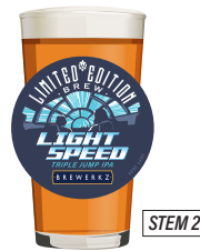
LIGHTSPEED TRIPLE JUMP IPA 10.0% ABV, 27 IBU Coconut, mango, apricot