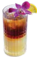
LONG ISLAND TEA 25 Gin, vodka, rum, tequila, triple sec, lime mix, splash of Coke