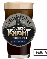
BLACK KNIGHT NITRO IRISH STOUT 4.1% ABV, 30 IBU Coffee, chocolate, cocoa