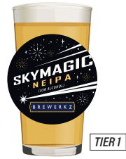
SKYMAGIC NEIPA LOW-ABV 2.4 ABV, 22 IBU Mango, passionfruit, red berries