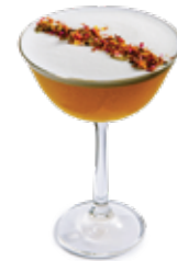
BOTANIC SLING 25 Tanqueray Gin, luxardo maraschino, Bols Apricot Brandy, blossom bitters, St-Germain Elderflower, egg white