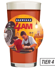
4AM DOUBLE IPA 7.5% ABV, 80 IBU Resin, pineapple, mango