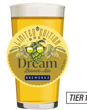
DREAM BLONDE ALE 4.5% ABV, 18 IBU Passionfruit, mango, lemon