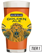
GOLDEN ALE 4.7% ABV, 22 IBU Malty, bitterness