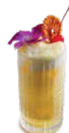
PIÑA COLADA 23 Malibu, pineapple juice, pineapple slice and cream