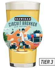
CIRCUIT BREAKER NEW ENGLAND IPA 5.9% ABV, 14 IBU Mango, cempedak, pineapple