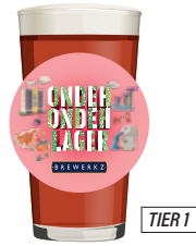
ONDEH ONDEH AMBER LAGER 4.5% ABV, 7 IBU Pandan, coconut