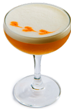
CUBAN SOUR 23 Don Papa rum, Bols apricot brandy, lemon & lime juice, egg white