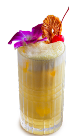
PIÑA COLADA 23 Malibu, pineapple juice, pineapple slice and cream