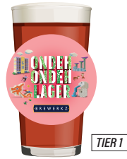
ONDEH ONDEH AMBER LAGER 4.5% ABV, 7 IBU Pandan, coconut