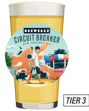
CIRCUIT BREAKER NEW ENGLAND IPA 5.9% ABV, 14 IBU Mango, cempedak, pineapple