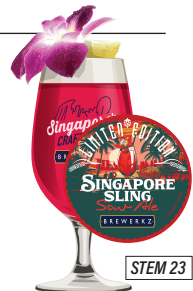
SINGAPORE SLING SOUR ALE 5% ABV, 1 IBU Sweet cherry, pineapple