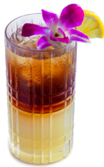
LONG ISLAND TEA 25 Gin, vodka, rum, tequila, triple sec, lime mix, splash of Coke