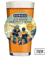
CHAIN REACTION MODERN IPA 5.0% ABV, 48 IBU Mango, pineapple