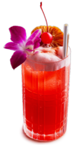
SINGAPORE SLING 25 Gin, cherry brandy, dom, orange liqueur, bitters, grenadine, pineapple, lime juice