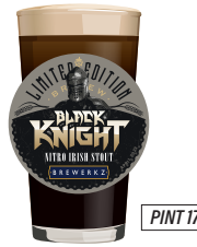
BLACK KNIGHT NITRO IRISH STOUT 4.1% ABV, 30 IBU Coffee, chocolate, cocoa