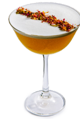
BOTANIC SLING 25 Tanqueray Gin, luxardo maraschino, Bols Apricot Brandy, blossom bitters, St-Germain Elderflower, egg white