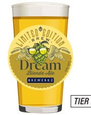
DREAM BLONDE ALE 4.5% ABV, 18 IBU Passionfruit, mango, lemon