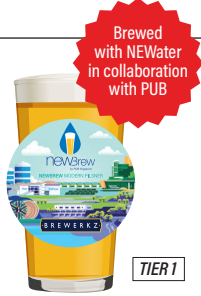
NEWBREW MODERN PILSNER 5% ABV, 15 IBU Rock melon, pineapple, white grapes