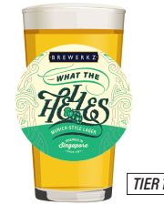
WHAT THE HELLES MUNICH-STYLE LAGER 4.5% ABV, 9 IBU Grainy sweet, floral