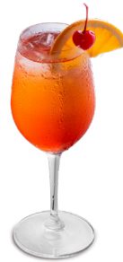
APEROL SPRITZ 21 Aperol, prosecco and soda water