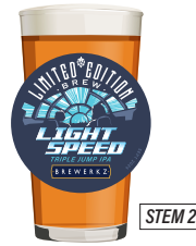
LIGHTSPEED TRIPLE JUMP IPA 10.0% ABV, 27 IBU Coconut, mango, apricot