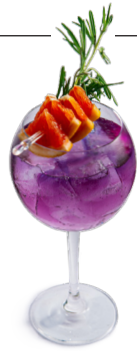
MYSTIC PEA 23 Brass Lion Butterfly Pea Gin, tonic, grapefruit, rosemary