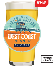
WEST COAST PILSNER 5.3% ABV, 40 IBU Citrus, pine, kaffir lime