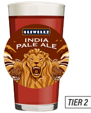
INDIA PALE ALE 5.4% ABV, 51 IBU Floral, malty