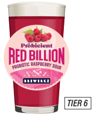
PROBIOTIC RED BILLION PROBIOTIC RASPBERRY SOUR 4.5% ABV, 0 IBU Fruity, tart raspberry