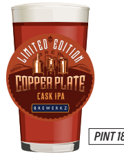
COPPER PLATE CASK IPA 5.0% ABV, 50 IBU Biscuity, orange