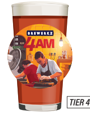
4AM DOUBLE IPA 7.5% ABV, 80 IBU Resin, pineapple, mango