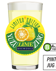
YUZU LIME ZING 0% ABV Yuzu, key lime