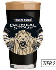
OATMEAL STOUT 5.5% ABV, 24 IBU Coffee, caramel, roasty