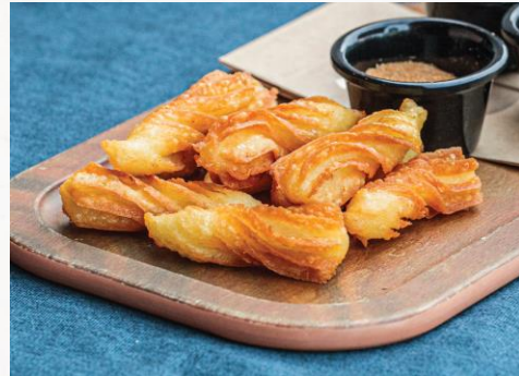
Shaker Churros (V)