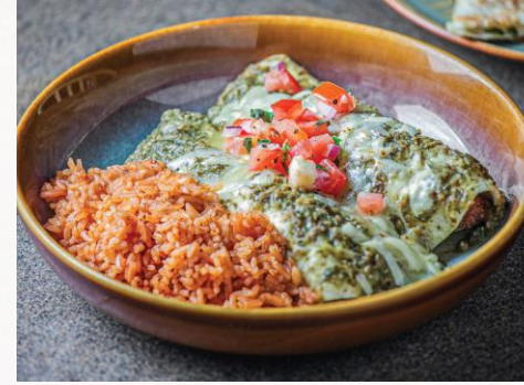
Red Snapper Enchiladas