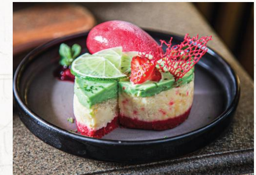
4 Cheese Mexican Burnt Cheesecake