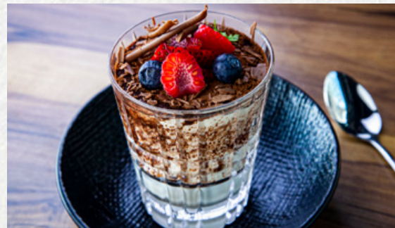
OATMEAL STOUT BEERAMISU 14 Savoiardi soaked in Oatmeal Stout, baileys and espresso coffee