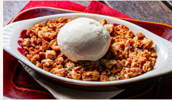
EXCLUSIVE SOUR CHERRY CRUMBLE 14 Walnut crumble, dark tart cherries, vanilla ice cream