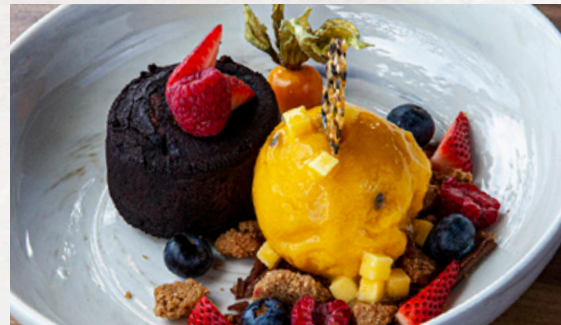
CHOCOLATE LAVA CAKE 16 Valrhona 72% dark chocolate fondant, mango-passionfruit sorbet, tropical fruit medley ⌚ Please allow 20 minutes for preparation