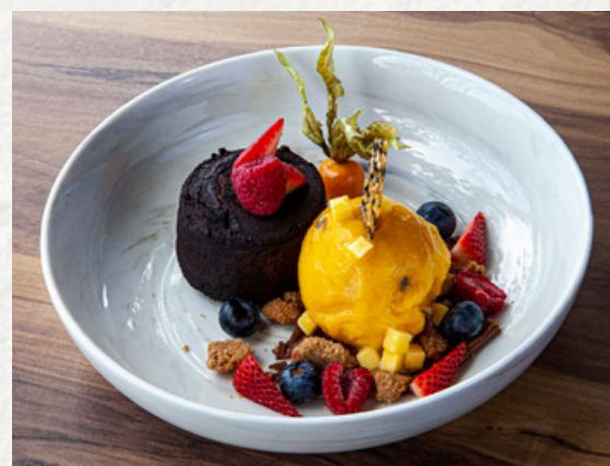
CHOCOLATE LAVA CAKE Valrhona 72% dark chocolate fondant, mango-passionfruit sorbet, tropical fruit medley Please allow 20 minutes for preparation