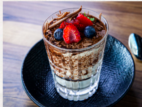
OATMEAL STOUT BEERAMISU Savoiardi soaked in Oatmeal Stout, baileys and espresso coffee