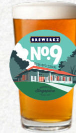
NO.9 FRESH HOP SESSION IPA 5% ABV, 50 IBU | TIER 3 Stunning freshly picked hop aroma with intensely tropical and dank tones