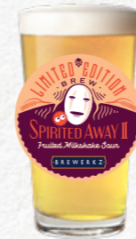
NEW SPIRITED AWAY II FRUITED MILKSHAKE SOUR 5% ABV, 3 IBU | STEM 16 *Only available in stem Passionfruit, orange, guava