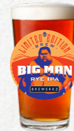
NEW BIG MAN RYE IPA 5.9% ABV, 45 IBU | TIER 1 Intense orange with rye bread spicy overtones