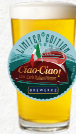
CIAO CIAO LOW CARB ITALIAN PILSNER 4.5% ABV, 5 IBU | TIER 1 Lemon zest, mint and floral notes