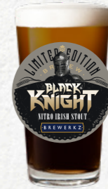
BLACK KNIGHT NITRO IRISH STOUT 4.1% ABV, 30 IBU | PINT 17 *Only available in pint Mild coffee, dark chocolate and cocoa