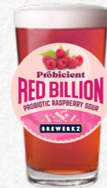
RED BILLION PROBIOTIC RASPBERRY SOUR 4.5% ABV, 0 IBU | TIER 5 1 billion live probiotic cells, raspberries