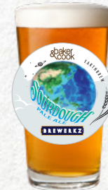
EARTHBREW SOURDOUGH PALE ALE 4.9% ABV, 20 IBU | TIER 1 Pink grapefruit, pine, apricot and toasted sourdough