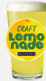
CRAFT LEMONADE 0% ABV | PINT 7 / JUG 16 Kick back and relish yourself with our refreshing homemade Craft Lemonade, perfect for staying cool in the summer heat.