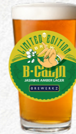
NEW B CALM JASMINE AMBER LAGER 4.9% ABV, 7 IBU | TIER 1 Prominent jasmine with notes of biscuit