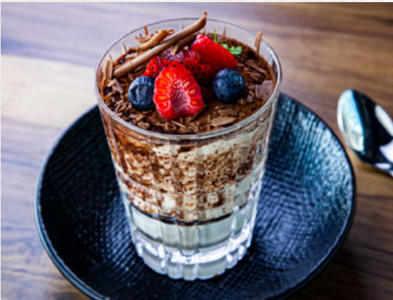
OATMEAL STOUT BEERAMISU Savoiardi soaked in Oatmeal Stout, baileys and espresso coffee