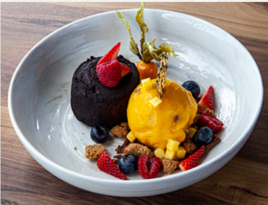
CHOCOLATE LAVA CAKE Valrhona 72% dark chocolate fondant, mango-passionfruit sorbet, tropical fruit medley Please allow 20 minutes for preparation