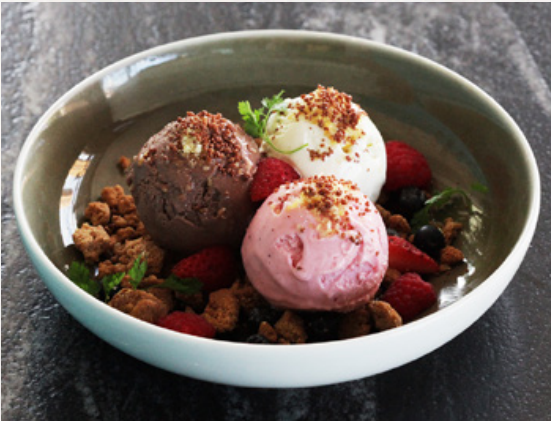
BREWERKZ ICE CREAM Trio of ice cream, cinnamon crumble