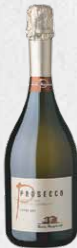
Prosecco B90 Santa Margherita Extra Dry, Italy, NV