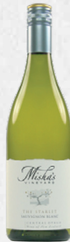
Sauvignon Blanc B130 Misha's Vineyard 'The Starlet', New Zealand, 2019