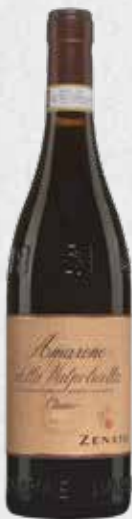
Amarone Della Valpolicella DOC Classico B175 Zenato, Italy, 2015