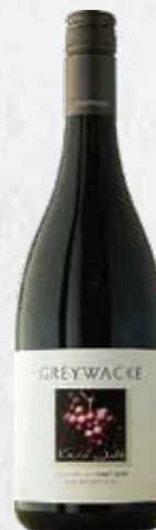
Pinot Noir B140 Greywacke, New Zealand, 2018