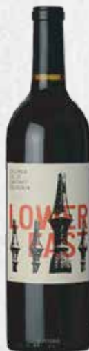
Cabernet Sauvignon B140 Gramercy Lower East, USA, 2016