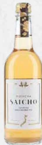
Saicho Sparkling Cold Brew B13 Hojicha Green Tea, Japan 0% Alcohol, 200ml