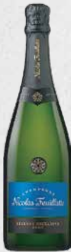
Brut B138 Nicolas Feuillatte Reserve Exclusive Brut, NV