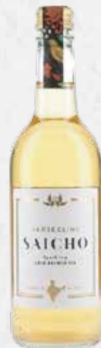
Saicho Sparkling Cold Brew B13 Darjeeling Black Tea, India 0% Alcohol, 200ml